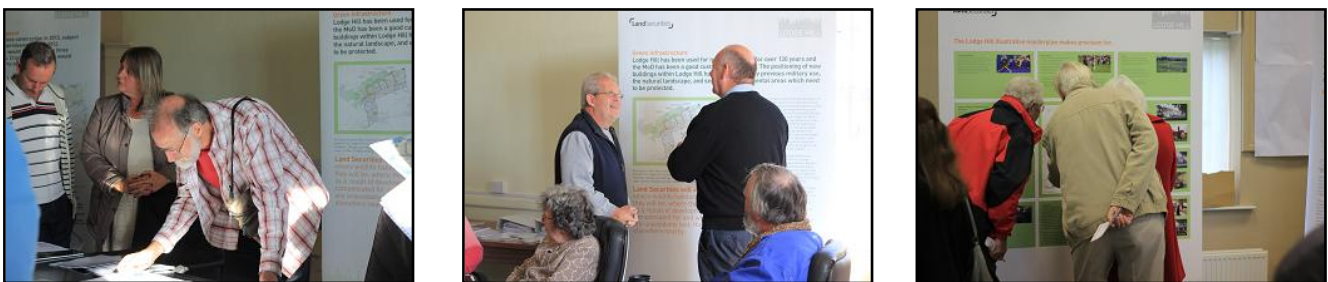
Images from the Lodge Hill exhibitions in October 2011

In total, 183 people attended the exhibitions in October 2011 and 96 people took part in the guided tours.