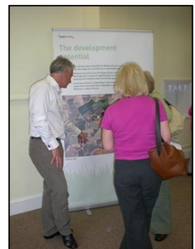
Images from the Lodge Hill exhibitions in April 2009